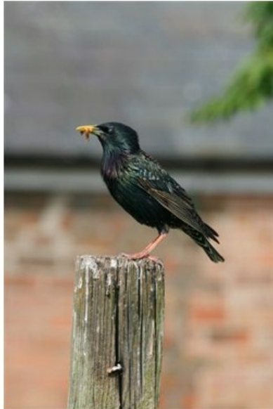
Mealworms are a favourite of many species

Feeding live food comes into its own at this time of the year. Adult birds cannot take water to their young in the nest, so water has to be included in the food. This is in the form of insects or unripe seeds.